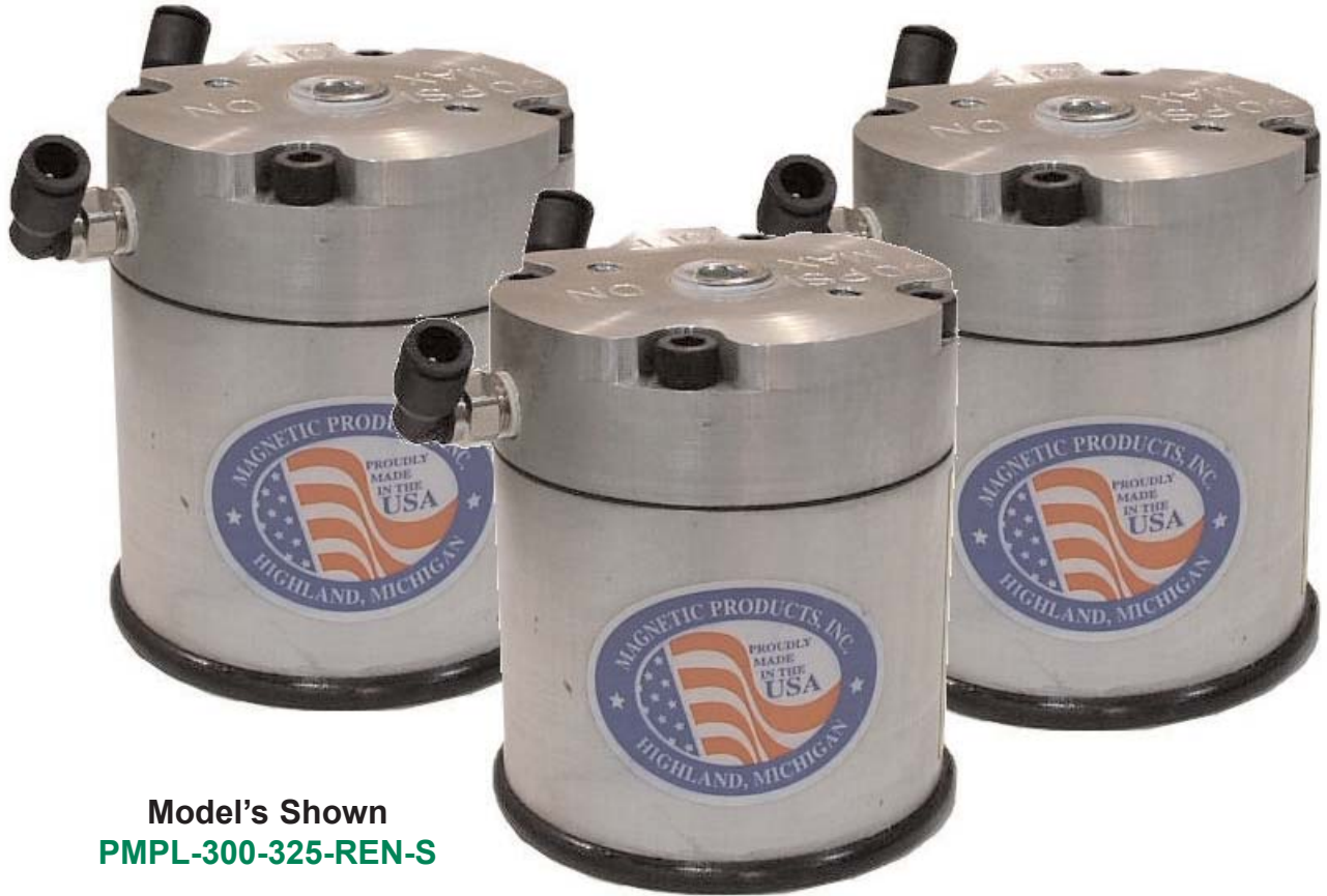
Model's Shown PMPL-300-325-REN-S