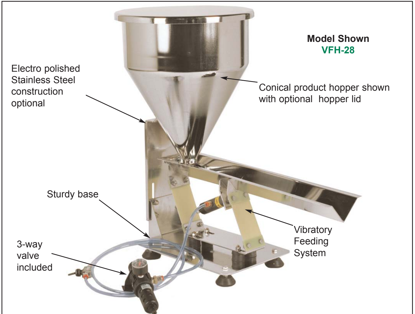
Model Shown VFH-28

Electro polished Stainless Steel construction optional