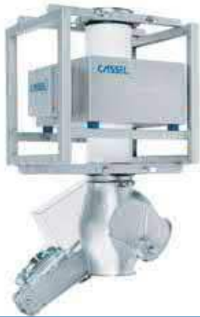
METAL SHARK® GF Gravity Feed