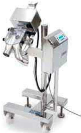
METAL SHARK® PH Pharma