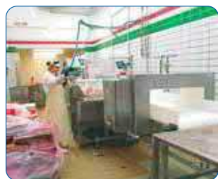
METAL SHARK® BD with LPW option during wash-up