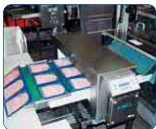
METAL SHARK® BD in line behind a deep drawing machine