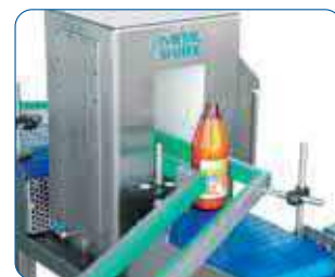
METAL SHARK® on Conveyor for bottles type JAR2