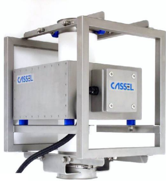
METAL SHARK® GF