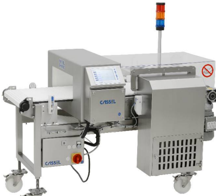
METAL SHARK® Conveyor