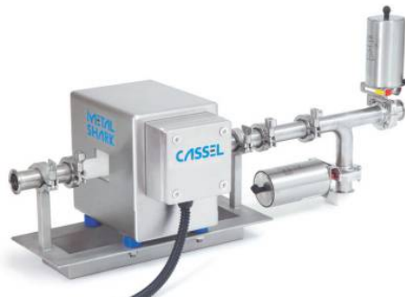
METAL SHARK® IN Liquid