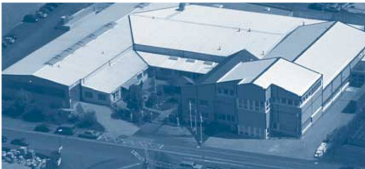
Cassel Messtechnik GmbH (Germany) – Headquarters and main production site

With its production facilities located near Hannover, Germany, Cassel manufactures approximately 1,000 inspection systems annually. Nearly 80 percent of Cassel equipment is exported to the European Union, United States, Southeast Asia, Australia, South Africa and South America. Cassel supplies equipment to several industries, including food production, plastics, pharmaceuticals, textiles, forestry and mining. Cassel machinery can be found in the production lines of many global and respected brands.