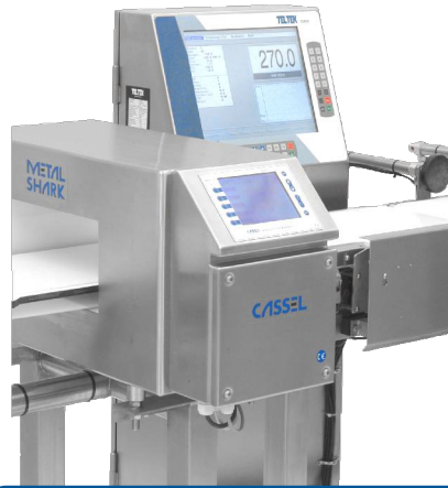
WEIGH SHARK® Checkweigher