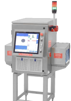
XRAY SHARK® X-Ray