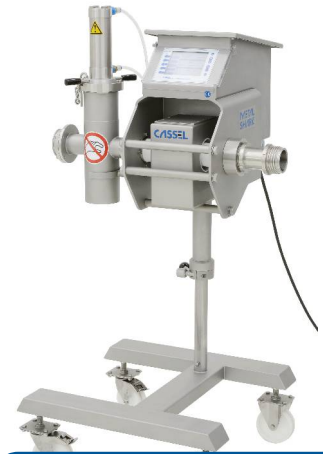
METAL SHARK® IN MEAT