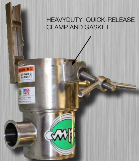
HEAVYDUTY QUICK-RELEASE CLAMP AND GASKET