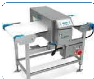
Standard conveyor type METAL SHARK® HW