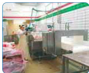
METAL SHARK® BD with LPW option during wash-up