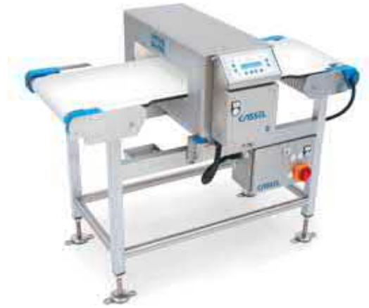
METAL SHARK® HW