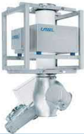
METAL SHARK® GF Gravity Feed