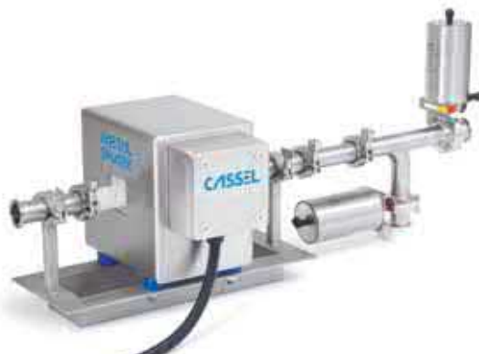
METAL SHARK® IN Liquid