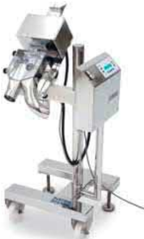
METAL SHARK® PH Pharma