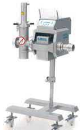
METAL SHARK® IN MEAT