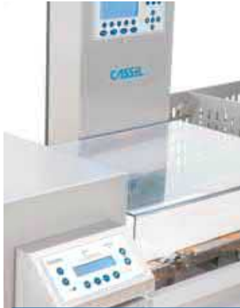
METAL SHARK® Checkweigher