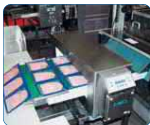
METAL SHARK® BD in line behind a deep drawing machine