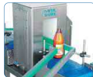
METAL SHARK® on Conveyor for bottles type JAR2