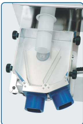
Disassemble the reject without tools