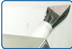
Infeed funnel included (mirror polished SS316)