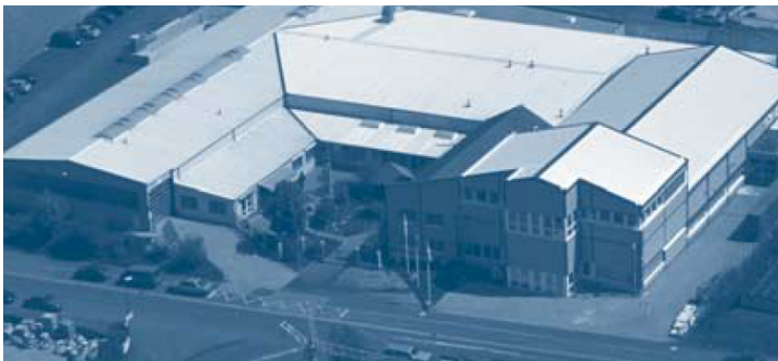
Cassel Messtechnik GmbH (Germany) – Headquarters and main production site

Located near Hannover, Germany, Cassel manufactures approximately 1.000 inspection systems annually. Nearly 80 percent of Cassel equipment is exported to the European Union, United States, Southeast Asia, Australia, South Africa and South America. Cassel supplies equipment to a number of industries, including food, plastics, pharmaceuticals, textiles, forestry and mining. Cassel equipment can be found in the production lines of many global and respected brands.